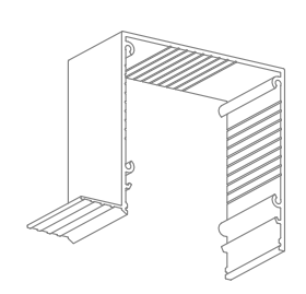
S100x100NS Skim Coat Flange on one side (reversible)